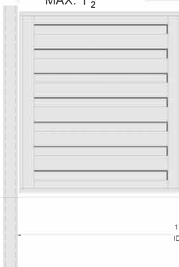
DOUBLE GATE OPENING

HINGE GAP IDEAL: \frac{7}{8} " MIN: \frac{1}{2} " MAX: 1\frac{1}{2} "