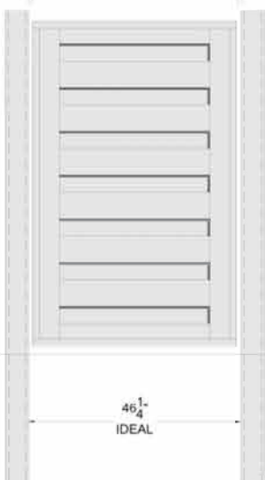
SINGLE GATE OPENING

LATCH GAP IDEAL: \frac{7}{8} " MIN: \frac{1}{2} " MAX: 1\frac{1}{2} "