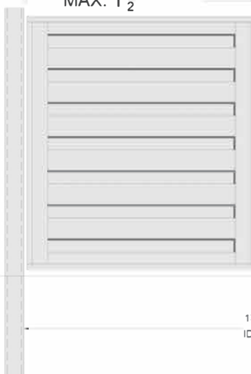
DOUBLE GATE OPENING

HINGE GAP IDEAL: \frac{7}{8} " MIN: \frac{1}{2} " MAX: 1\frac{1}{2} "